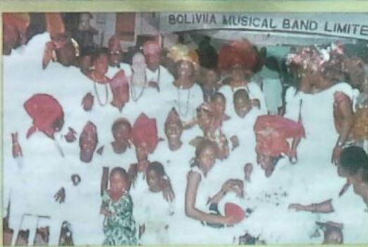
BOLIVIA MUSICAL BAND LIMITED